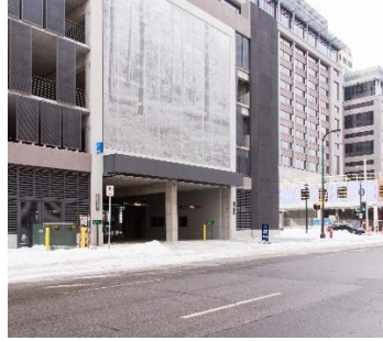
701 S 3 rd Street